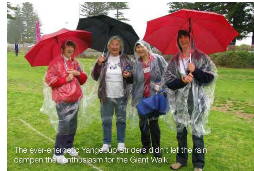
The ever-energetic Yangebup Striders didn't let the rain dampen their enthusiasm for the Giant Walk

The City of Fremantle and the City of Cockburn look forward to working together on more joint physical activity events in the future.